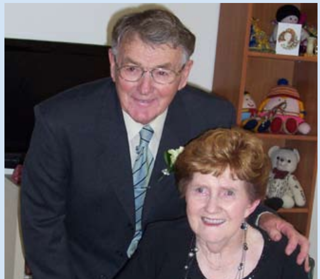
The happy couple on their day of celebration.

The event was covered by the local newspaper and received a full page feature.